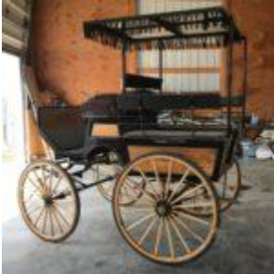
Fringe Top Surrey Excellent Condition