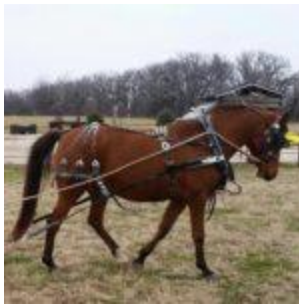
Team Bio Harness Quarter Horse Size