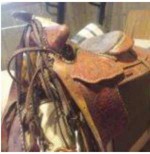
Hereford Aristocrat Saddle & Matching Bridle