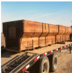
Two Brown Lynch Scott Flare Wagon Boxes