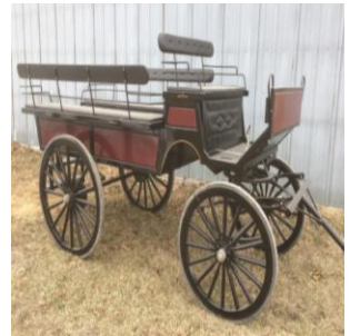
Eight Passenger Wagonette with Hydraulic Brakes