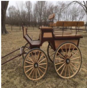
Four Passenger Wagonette