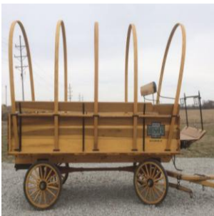
Covered Wagon with Canvas