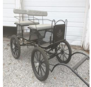
Two Seat Roberts Trail Buggy